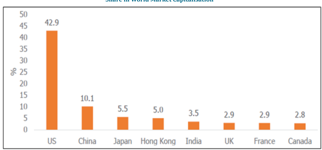
Share in World Market Capitalisation*

With the increasing demand for infrastructure spending and an over-reliance on the banking sector to meet funding requirements, role of the capital market in mobilising capital for productive investment and bridging the funding gap assumes significance. A well-developed and deeper capital market enhances economic growth through financing the long-term investment requirements and also encourages discipline among businesses to perform. It also helps in diversifying credit risk and in reducing the cost of capital through promoting innovative and cost-effective financial instruments.